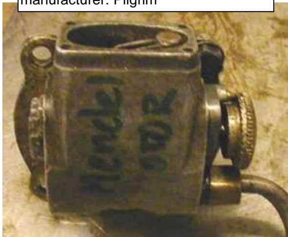
Oil pump model B, C, D (as of 1927), manufacturer: Pilgrim