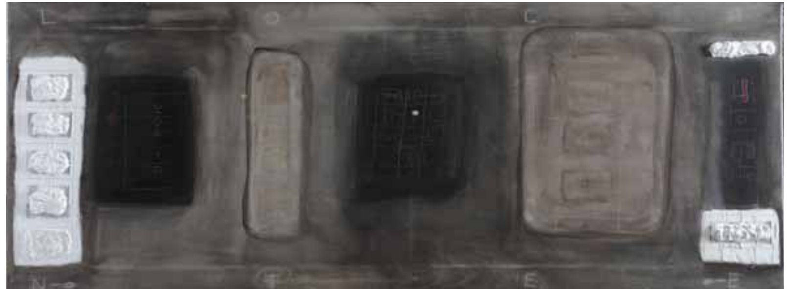
Chapter 75 (2007)