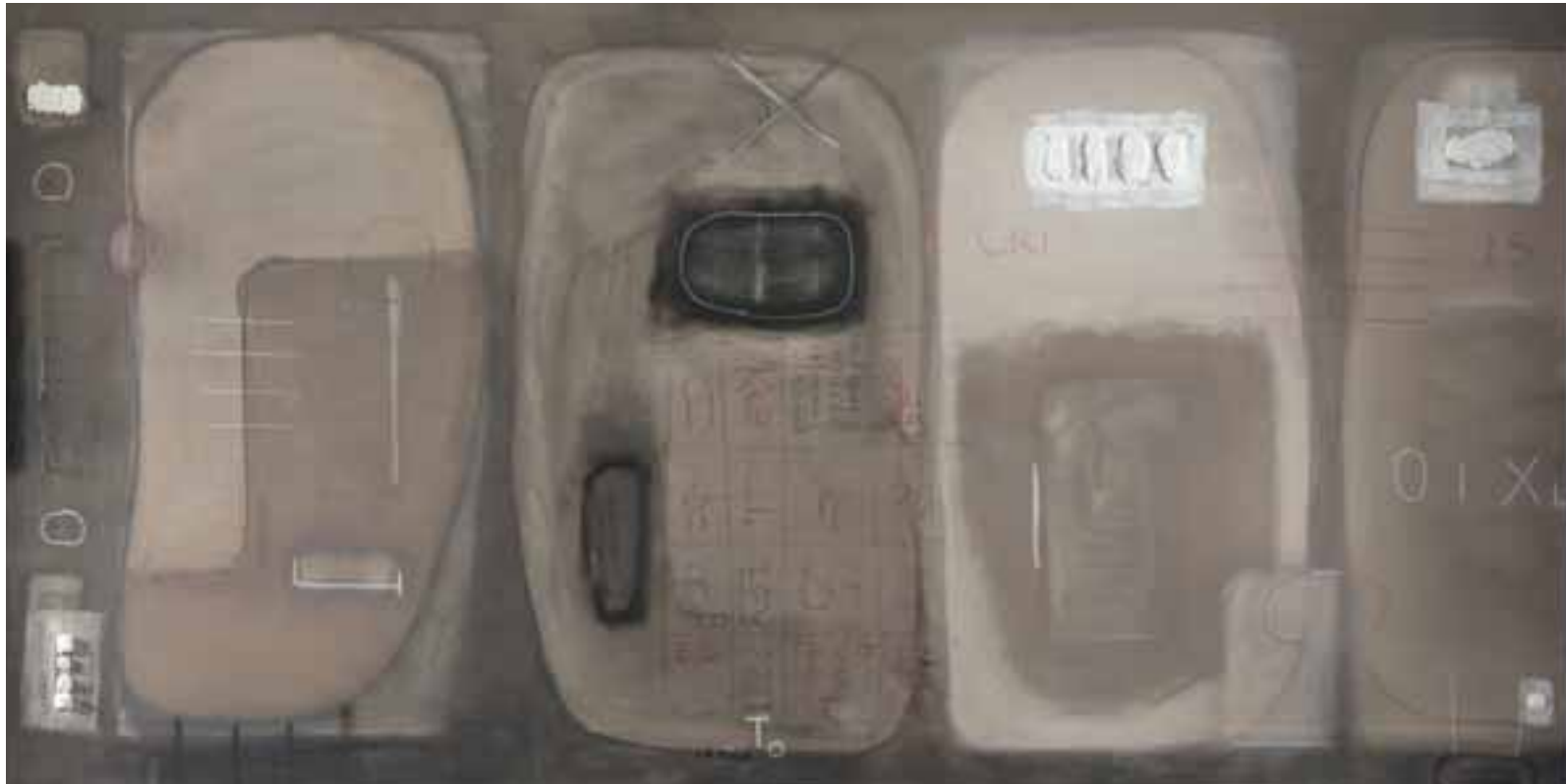
Chapter 82 (2007)