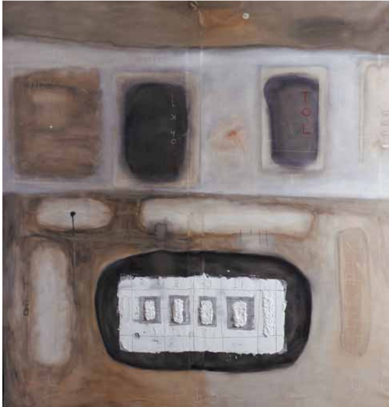
Chapter 77 (2007)