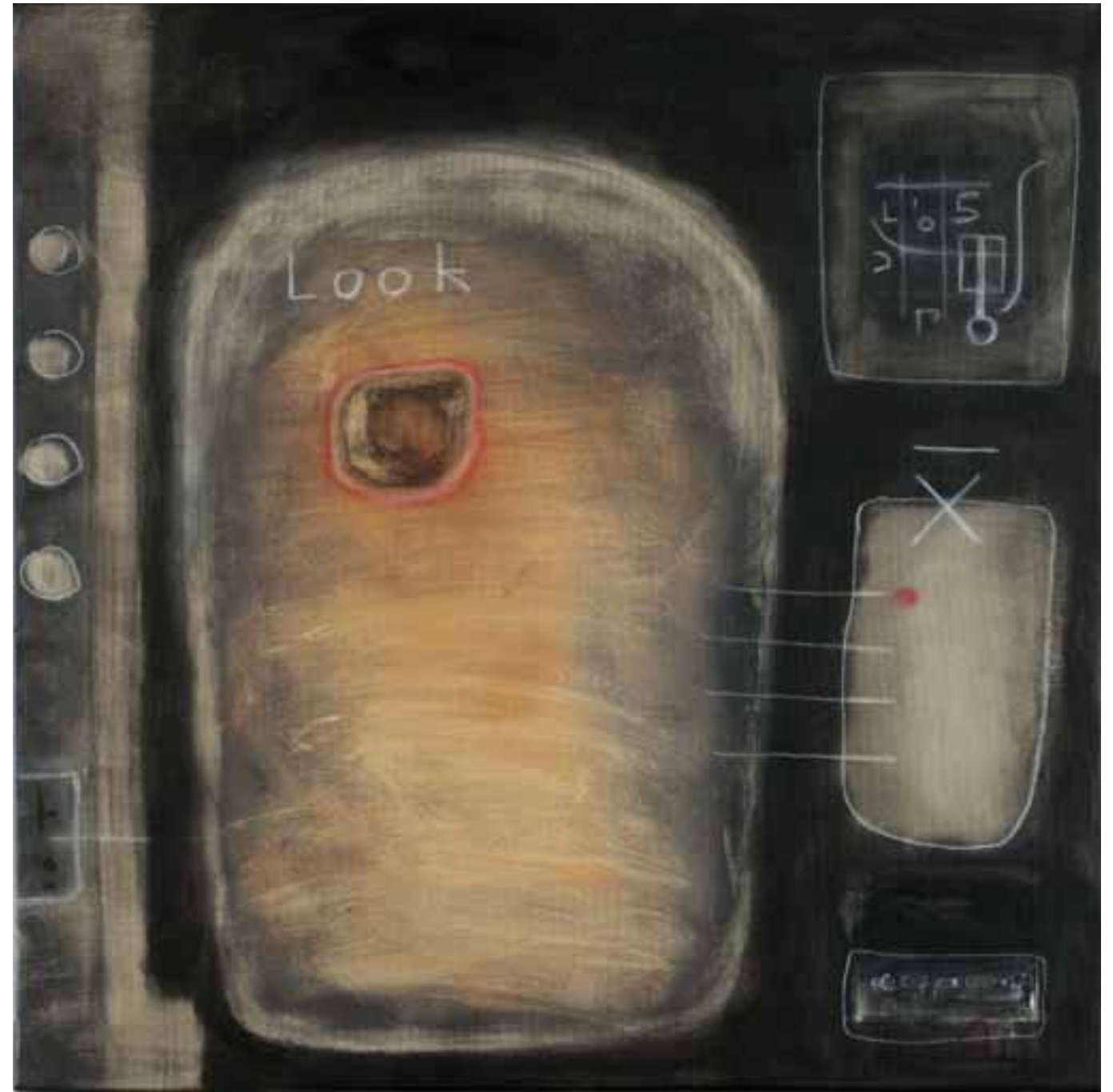
Chapter 84 (2007)