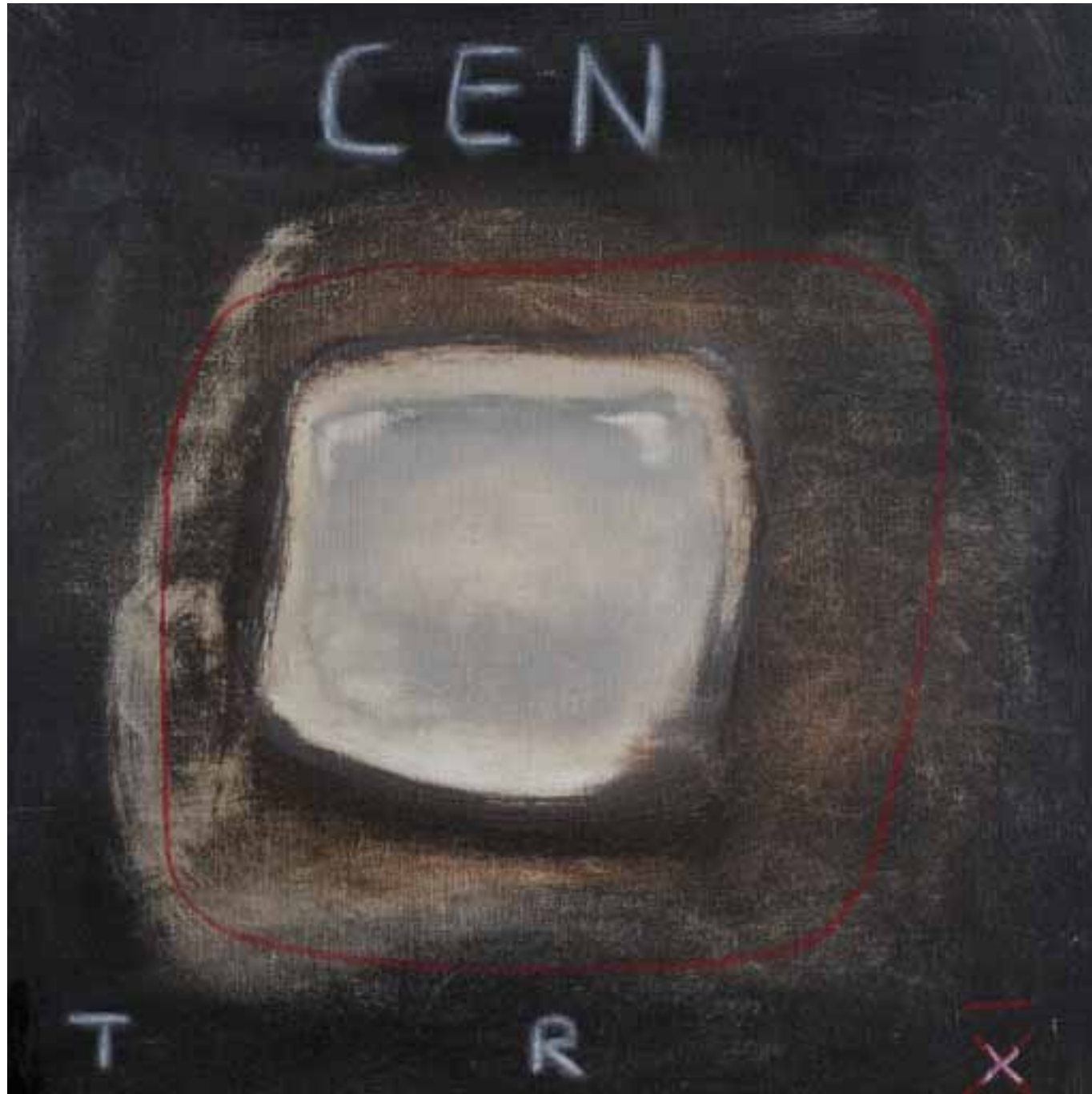
Chapter 49 (2007)