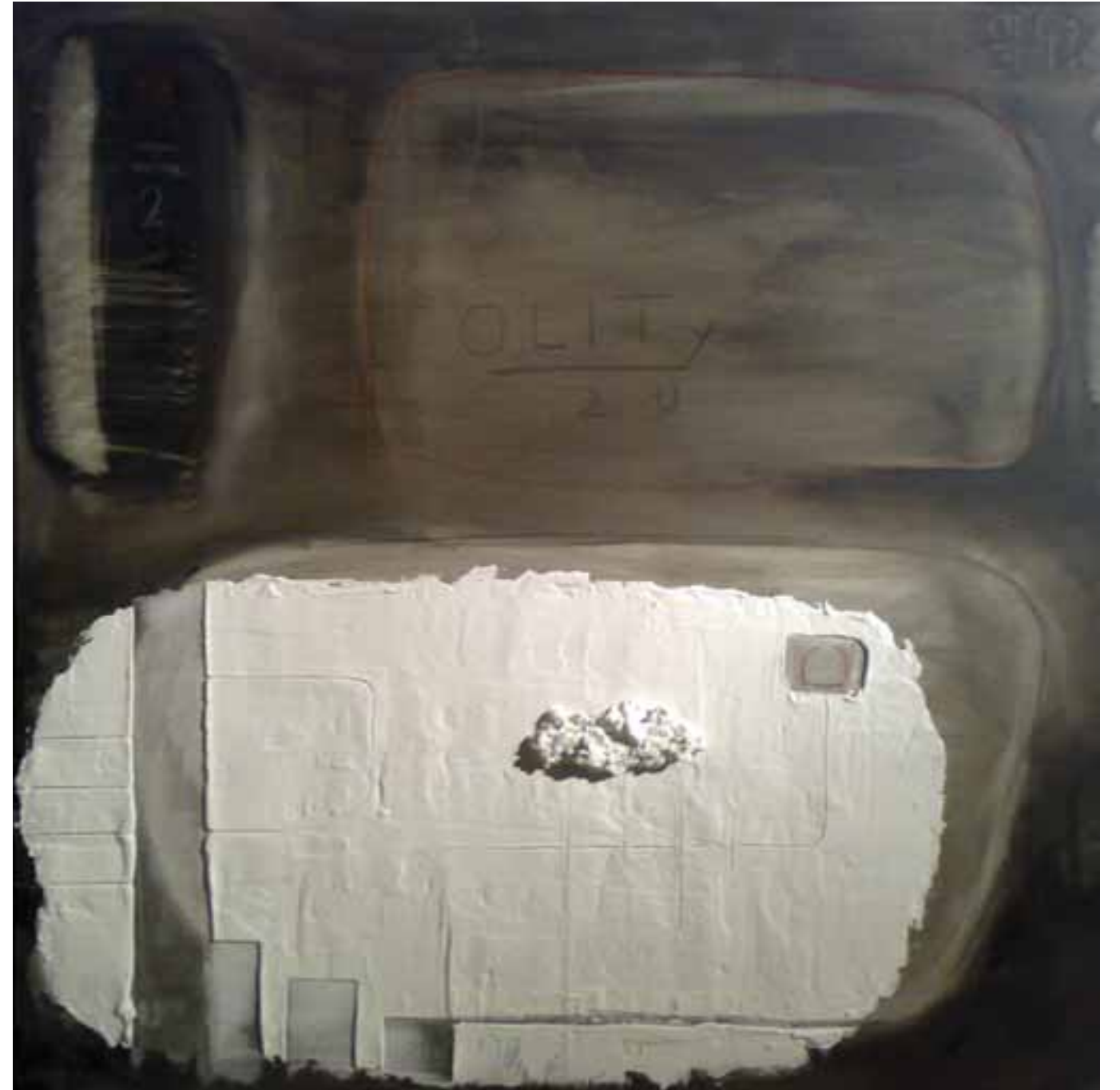
Chapter 68 (2007)