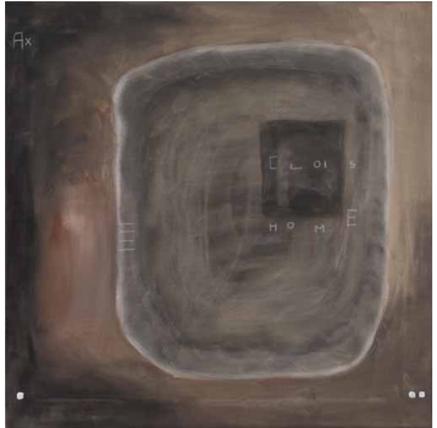
Chapter 83 (2007)