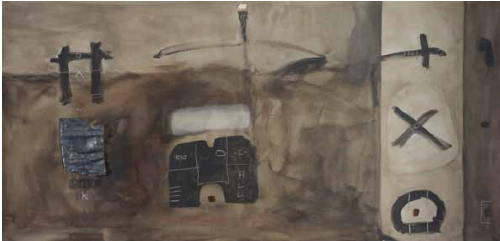
Chapter 85 (2007)