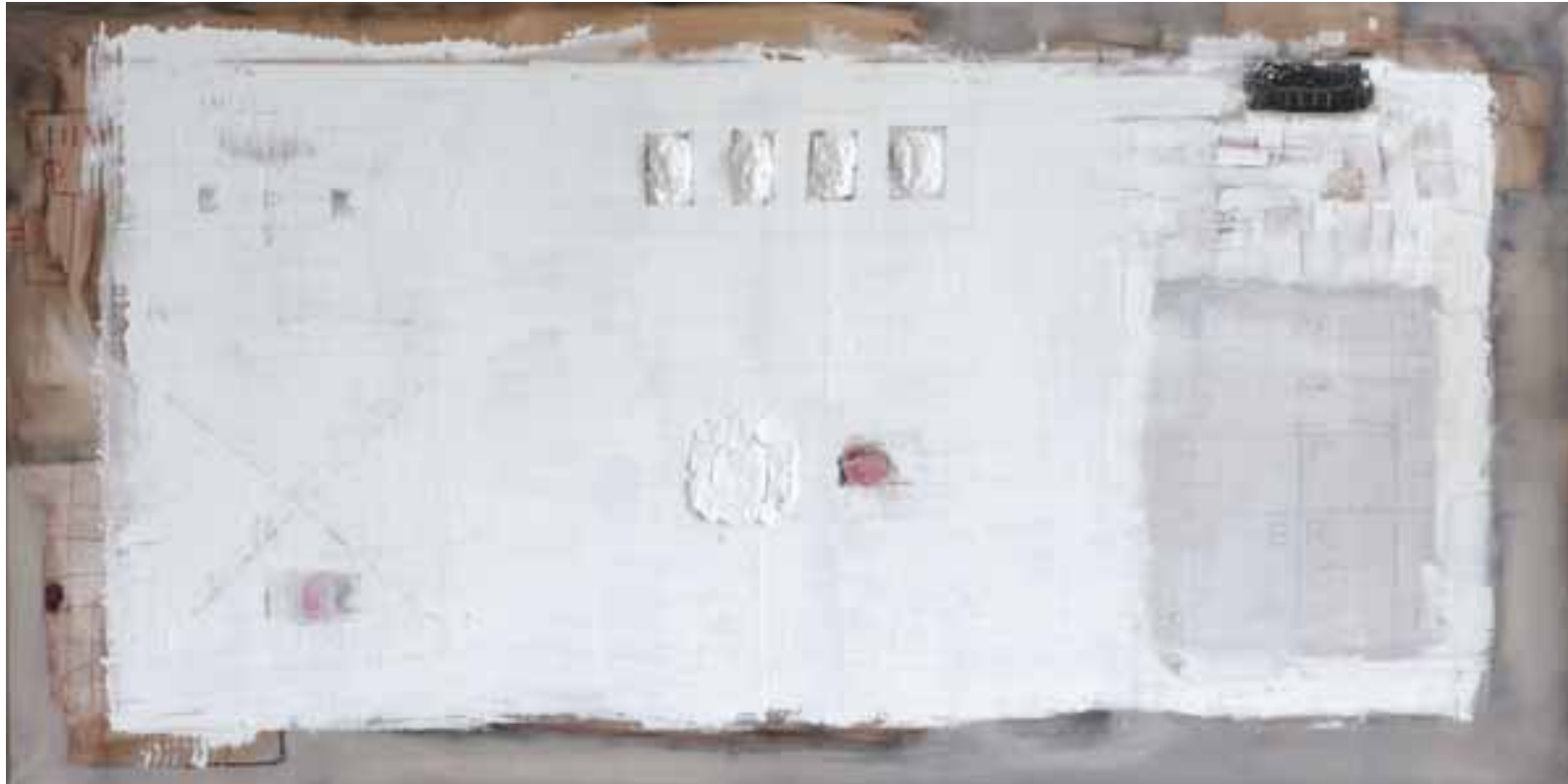
Chapter 73 (2007)