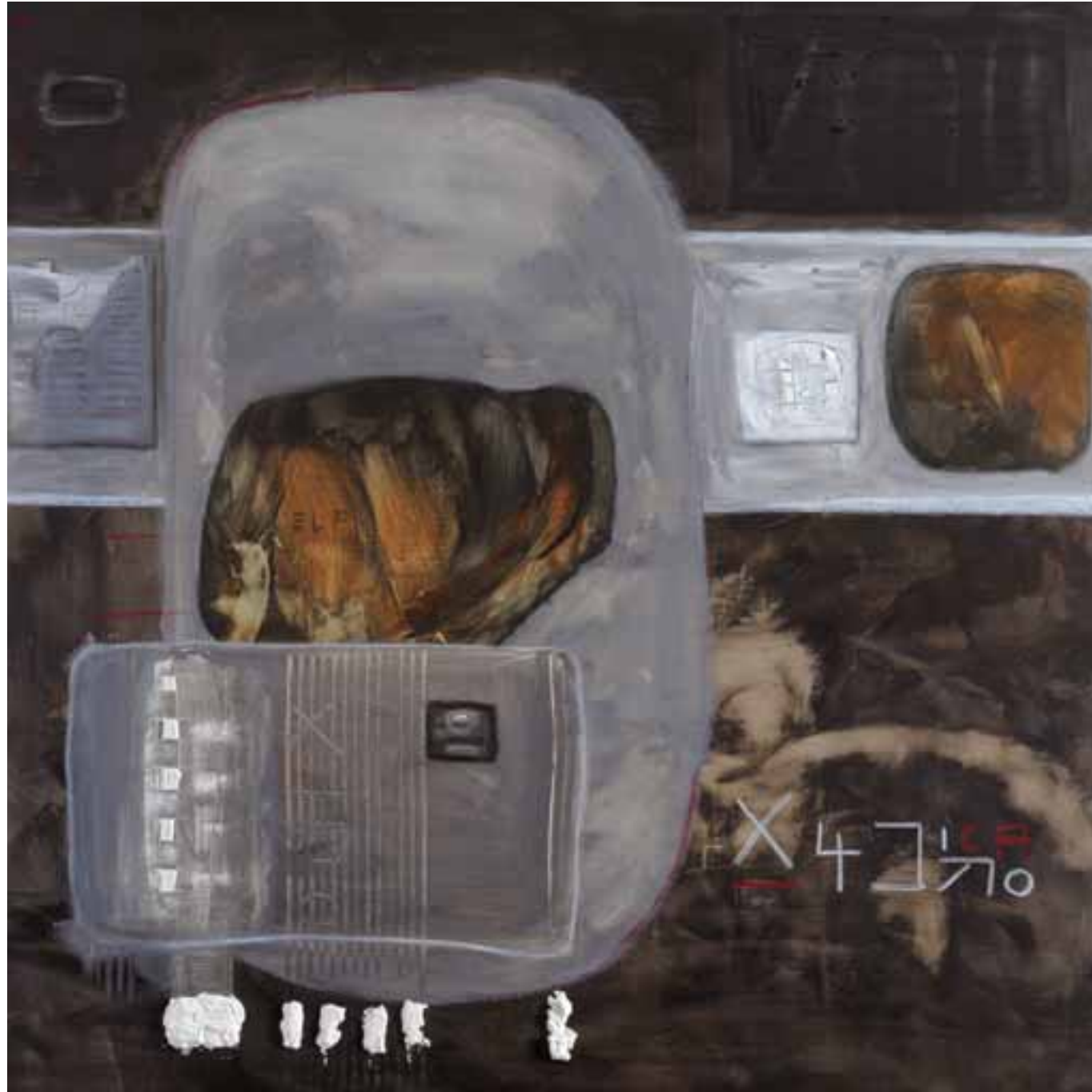
Chapter 74 (2007)