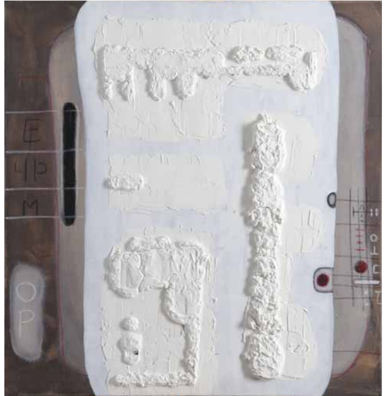
Chapter 47 (2006)