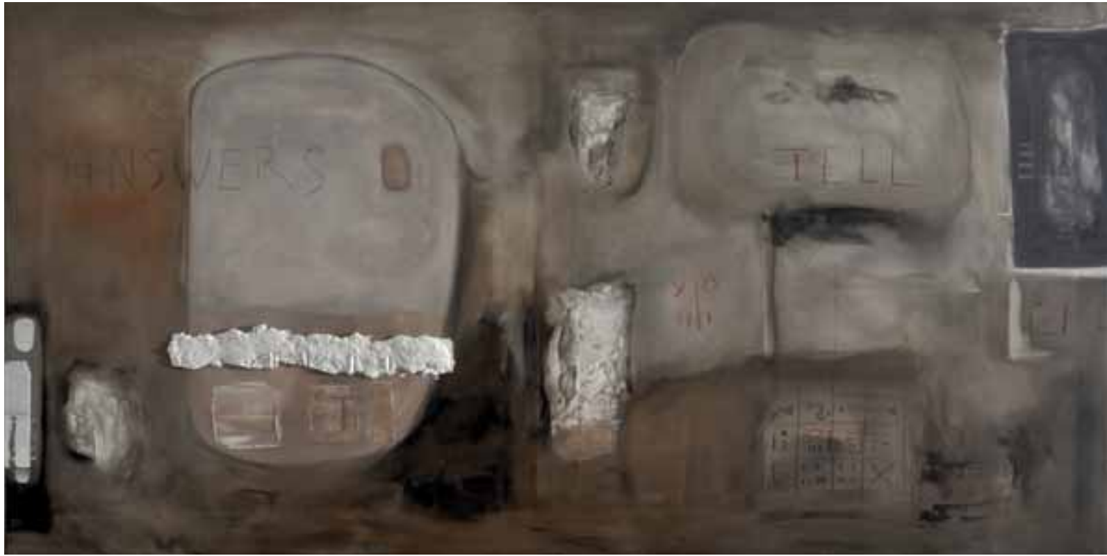
Chapter 69 (2007)