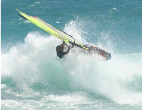
Hitting the lip

Wout and I decided to drive to Cape Point. Best decision of the trip, the waves were 2-3 meter and the wind was blowing perfectly for 4.2 in the beginning. There was one peak right in front of the rock where the bigger sets broke every time the same! A perfect lip to smack while waveriding or hit while jumping! We sailed there for 2 hours all by ourselves until Sofie joined us!