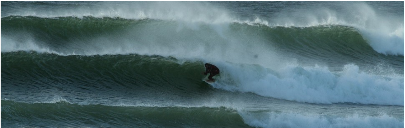
Milnerton can also be surfers paradise if you're there with the right swell and the right tide...