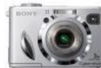
Sony Cybershot DSCW7 7MP Digital Camera with 3x Optical Zoom